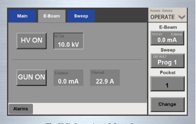
The EBC's Operations>E-Beam Screen

In evaporators without a PCL-based system controller, the TemEBeam EBC Integrated Controller provides the sole means of controlling the E-Beam power supply. In such systems, the EBC is therefore a required accessory for the CV-6SLX. Using the EBC's touch screen (see illustration below), the user can switch the e-beam on/off or switch the high voltage and the gun on and off independently of each other. The EBC also enables the user to set the kV and the emission power setpoints and to monitor the emission and filament currents in real time. The EBC can be configured to operate in stand-alone mode or in conjuction with single-and multilayer deposition controllers or PLC-based system controllers.